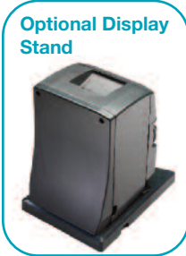
Optional Display Stand