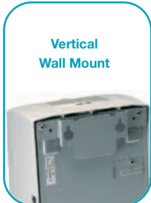
Vertical Wall Mount