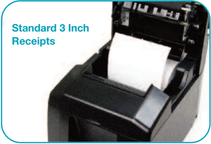
Standard 3 Inch Receipts