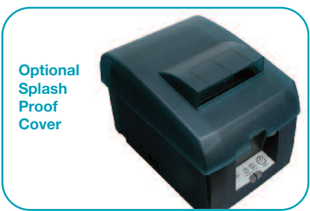
Optional Splash Proof Cover